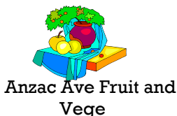
Anzac Ave Fruit and Vege

Suite 2 ABC Building 297 Margaret Street Toowoomba Qld 4350 www.kerryshinemp.com